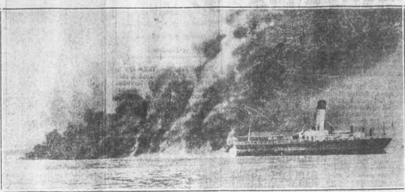
Blazing naphtha was scattered over Kill van Kull at Bayonne, N. J., by an explosion on the oil tanker Black Sea. Almost overcome by heat, eight members of the crew were rescued. Another ship ran aground in getting away from the flames.