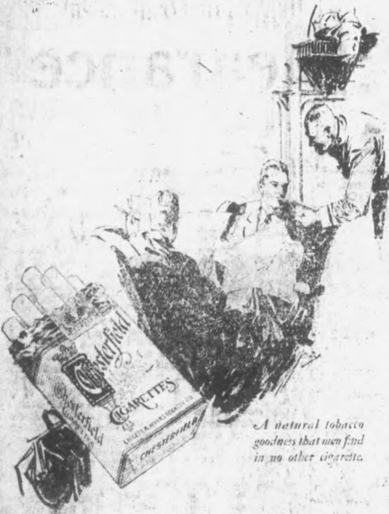
A natural tobacco goodness that men find in no other cigarette.

For four years running, America's fastest-growing cigarette