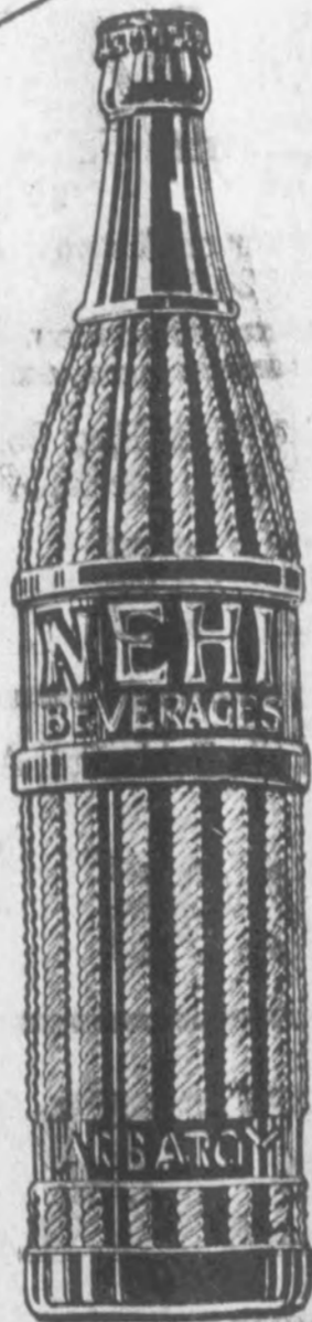
The Patented NEHI Bottle

PORTER & TUCKER General Mds. Fountain Service Grimesland, N. C.