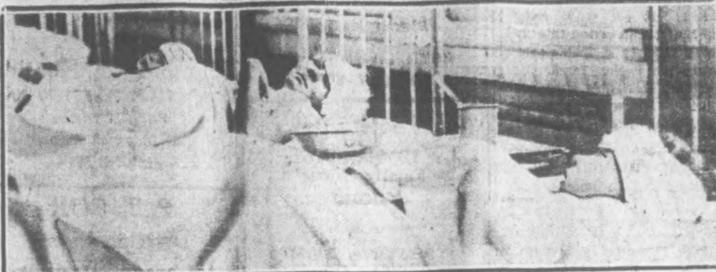
Children injured in the cyclone that wrecked a school at La Plata, Md., struggled for life at a Washington, D. C., hospital. More than a dozen of their playmates were crushed to death.