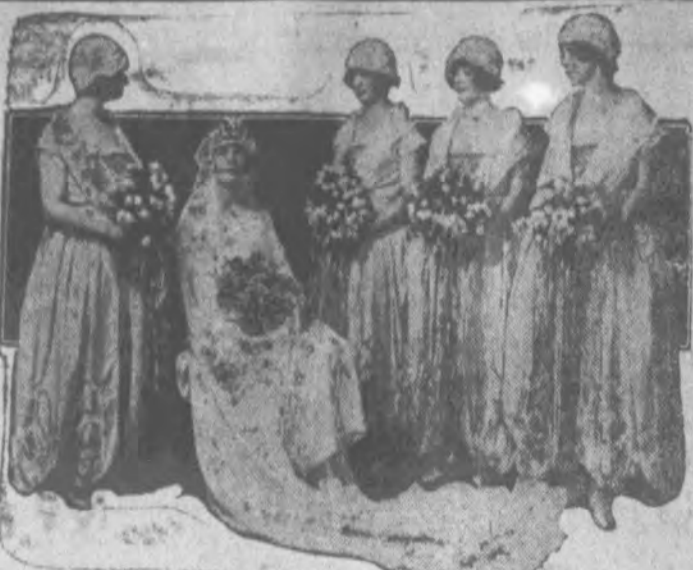
Wedding scene in "Abie's Irish Rose," Anne Nichols' comedy triumph. At White's Theatre, Greenville, Tuesday night, April 20th. One night only.