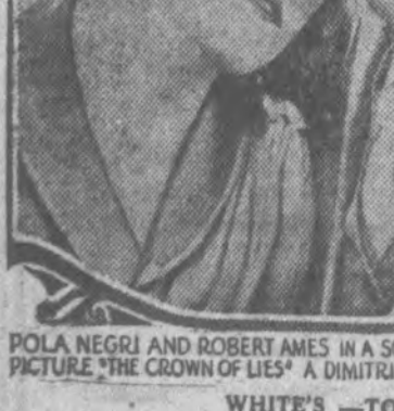
POLA NEGRI AND ROBERT AMES IN A SCENE FROM THE PARAMOUNT PICTURE "THE CROWN OF LIES" A DIMITRI BUCHOWETZKI PRODUCTION WHITE'S—TOMORROW

J. W. COBB Dist. Mgr. Nat. Casualty Co. 205 Nat. Bank Bldg. LIVE AGENTS WANTED