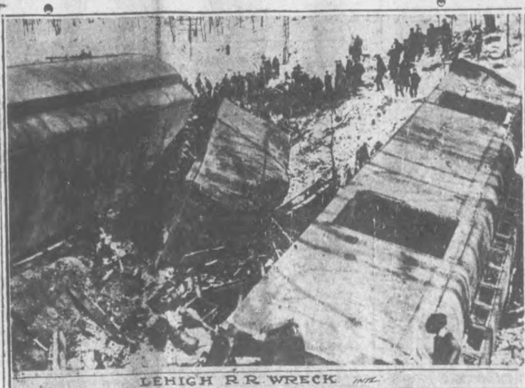
Wreckage of express train No. 19 on the Lehigh Valley railroad which jumped the icy tracks on a curve on Ashley Mountain near Newport Station, Pa. The engineer was killed and four of the train crew injured. The engine is buried beneath the overturned car on the right.

BOMBARDMENT DIRECTED TODAY AT PROHIBITION