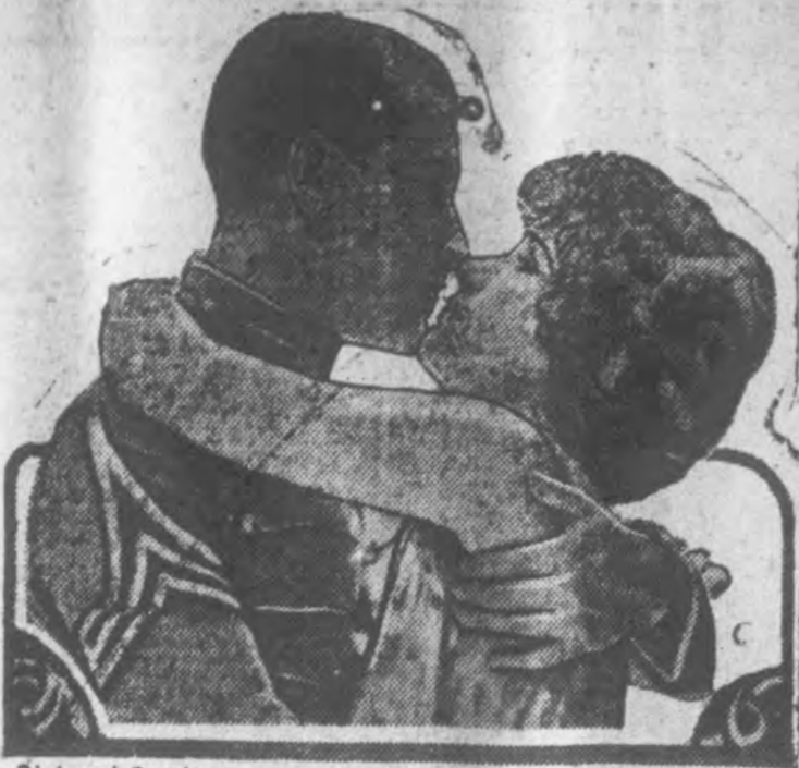
Richard Barthelmess and Madge Evans in "Classmates"

Richard Barthelmess brings West-point Cadet to screen for first time. Most unusually entertaining program on at White's Monday and Tuesday. Keith Vaudeville act added feature.