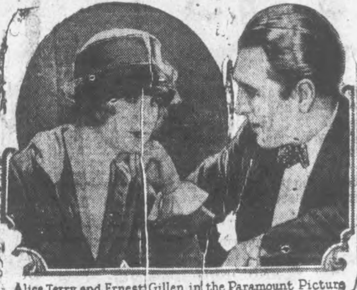
Alice Terry and Ernest Gillen in the Paramount Pictures 'Any Woman' A. Henry King Production.

Sentenced to serve 4 months to work on roads. If defendant pays fine, cost sentence to be stricken out.