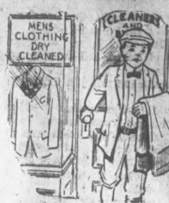
We Are Specialists

in San Francisco \society. He 3: the dry cleaning of men's practically exiled to a tropical island clothing. We handle everywhere he manages his father's rub- thing from a heavy overcoat to ber plantations. In contrast with the beautiful pictures of the married life work with equal excellence, And when we get through with a garment it will be fit to wear anywhere in any company. It will take but one trial to con-