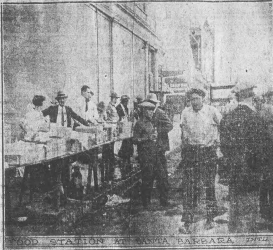
Because temporary food stations were established in the streets of Santa Barbara, few of the earthquake torn city's citizens missed a meal.