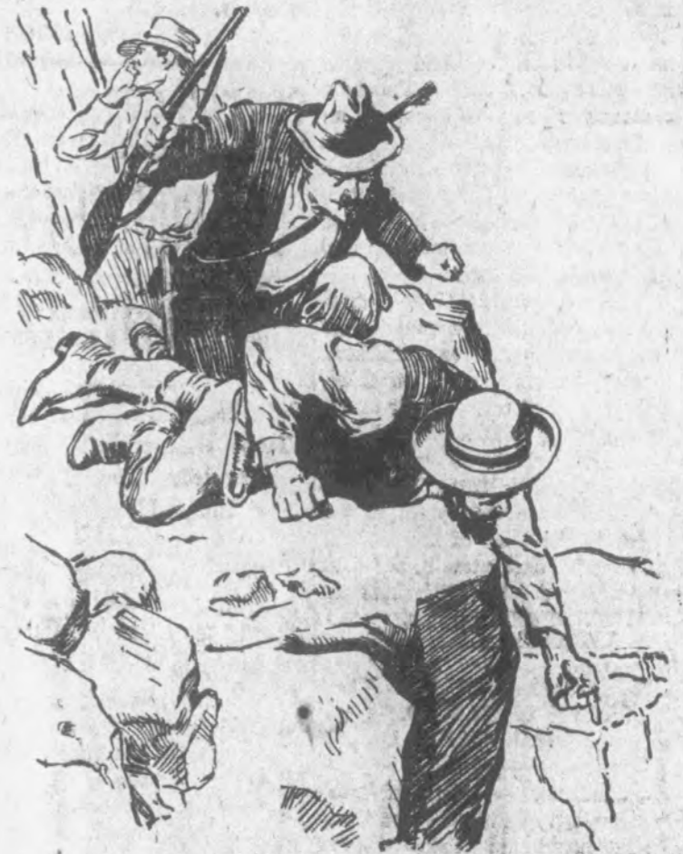
There came a frightful rending crash... The bridge was gone!

Now that we had the clue to his action, each of us could cast back and remember some sinister act upon the part of the half-breed—his constant desire to know our plans, his arrest outside our tent when he was over-hearing them, the furtive looks of hatred which from time to time one or other of us had surprised. We were still discussing it, endeavoring to adjust our minds to these new conditions, when a singular scene in the plain below arrested our attention.