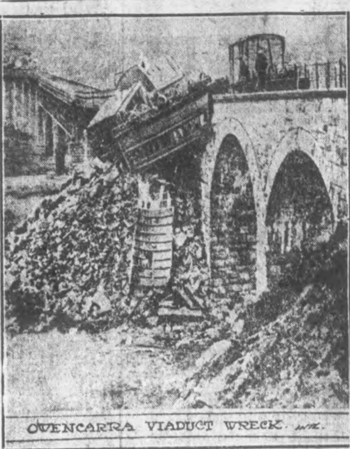
While crossing a trestle over a deep and wide ravine in Donegal, Ireland, a train was blown off the rails and several of the cars fell forty feet to the bottom of the valley, causing the deaths of four persons and serious injury to nine others. The victims lay for hours in the storm before help reached them. Photo shows the wreck of the train and the debris from the shattered Owenarra Viaduct which piled up on the passengers.