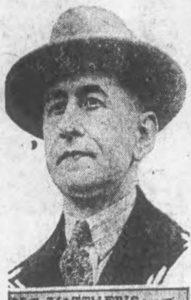
Harry Grindell Matthews, English inventor of the "Death Ray," is in New York for conferences with American scientists. As no disposition has yet been made of Matthews' invention, which is supposed to kill all that is subjected to its light, it is possible that tests looking to its utilization may grow out of the conference.