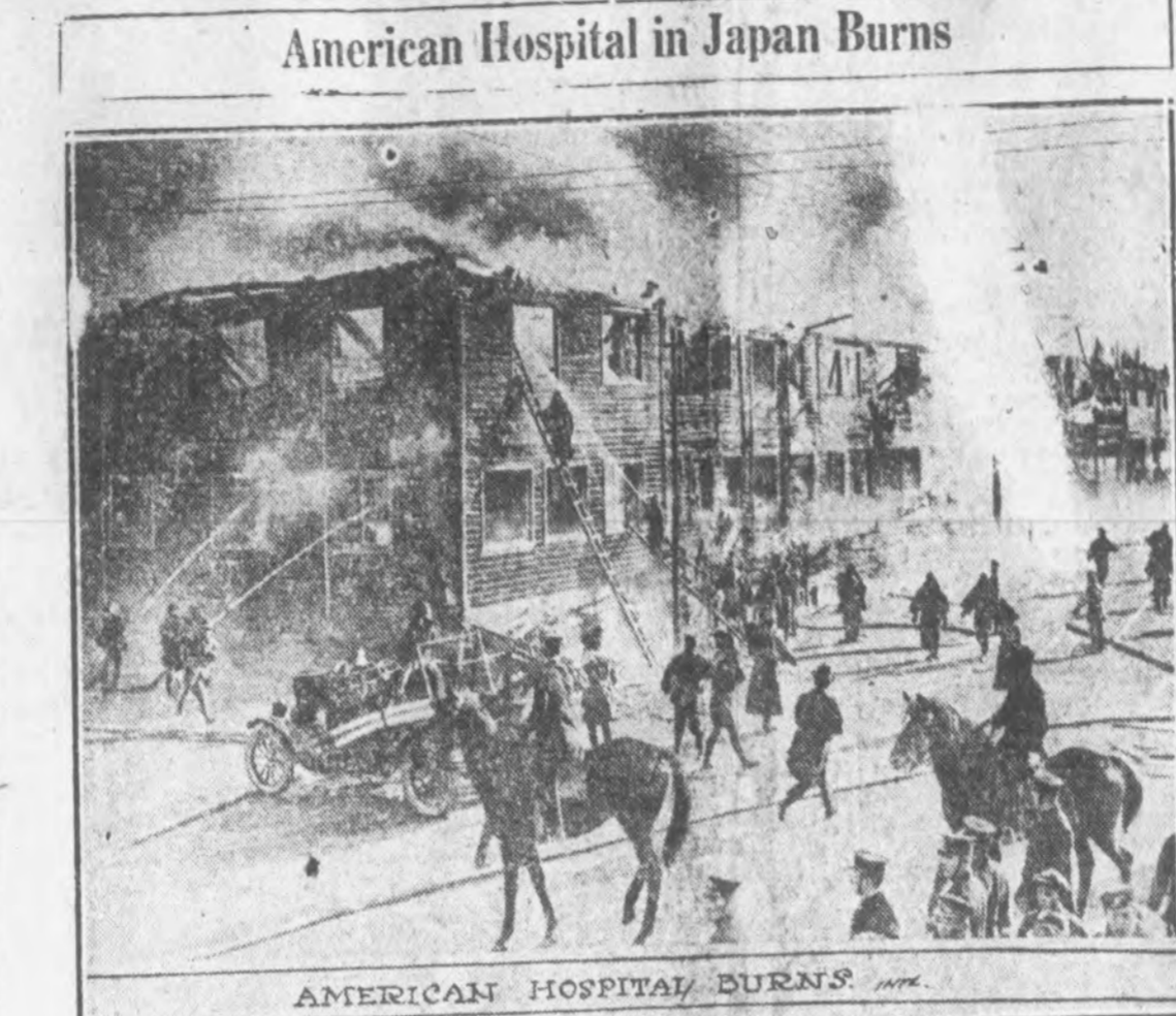
American Hospital in Japan Burns Above is shown the fire that destroyed St. Luke's Hospital, operated by the American Episcopal Church Mission, in Tokio, Japan. The building, a temporary structure used since the earthquake and fire of 1923, was gutted with a loss of $150,000. This remarkable photo was taken just as the roof crashed in with a roar.