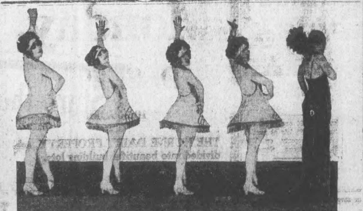
Some of famous beauty chorus of the "Ziegfeld Follies," White's Monday.