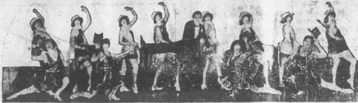
One sees lot's o' girls and lot's of 'em in Flashes of the Great White Way, the big New York bound extravaganza founded on Parisian lines of frankness, which comes to the White's Theatre, tonight.