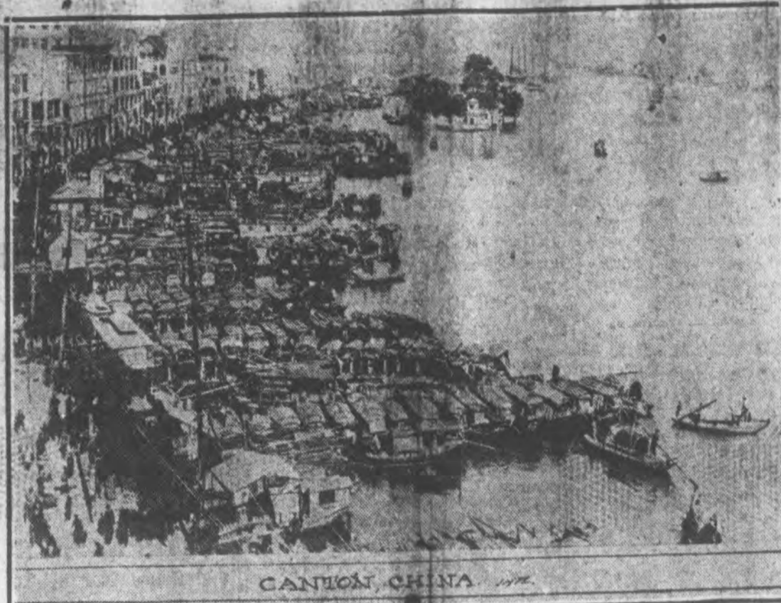
The Merchant Volunteer Corps of Canton, China, known as the Chinese Fascists, has been defeated by the "Red Army," composed of Chinese laborers, after a two-day fight in the city streets. A conflagration resulted from the hostilities that was brought under control only after $7,000,000 loss had been sustained. Many were killed and burned to death. The fighting had no connection with the Shanghai war.