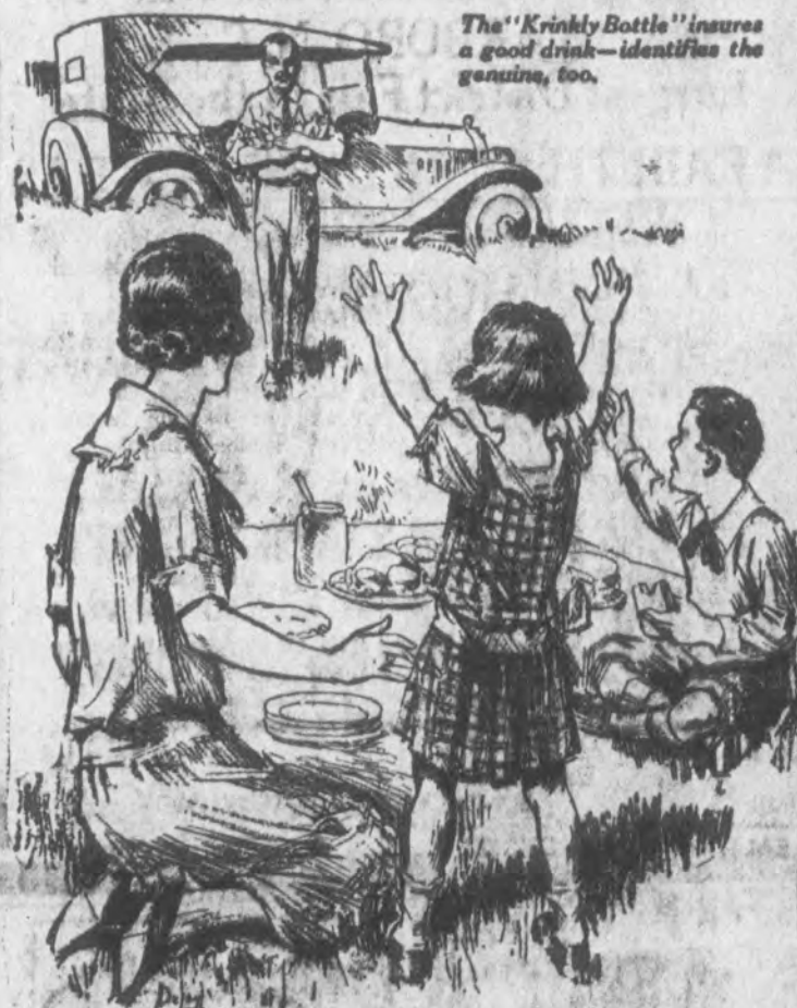
The "Krinkly Bottle" insures a good drink—identifies the genuine, too.

Ward's Crushes are more than merely delicious—they are wholesome and have a real food value. Read our formula. Here it is: To the natural fruit oils of oranges, lemons and limes are added citrus fruit juices, carbonated water, fruit acid, U. S. Certified food color and pure cane sugar.