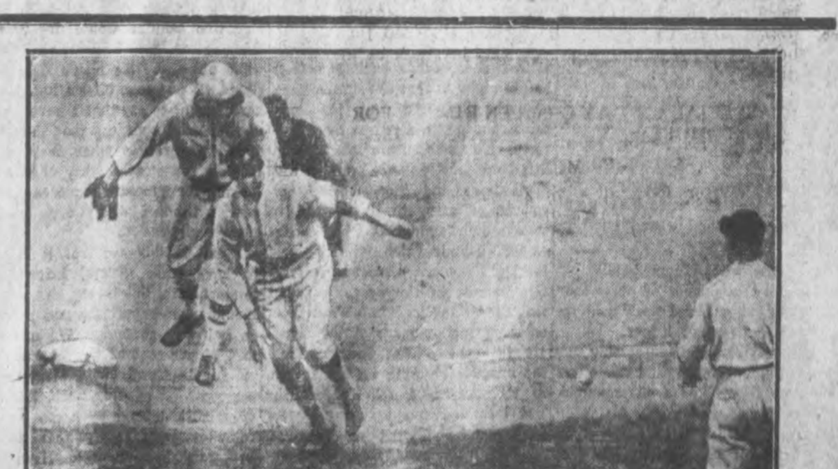
SAM RICE OF WASHINGTON SAYS AW FIRST IN SECOND INNING FIFTH GAME WORLDS SERIES AS KELLY OF GIANTS MIFFS BALL