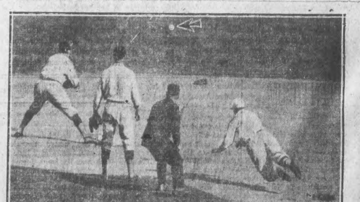
GREATEST ACTION PICTURE OF WORLDS SERIES. ROSS YOUNG OF GIANTS, DIVES DESPERATELY INTO SECOND TO DEATH THROW IN FROM KELLY'S LONG SACRIFICE HIT IN FIRST INNING, FOURTH GAME. NOTE BAIT IN AIR.