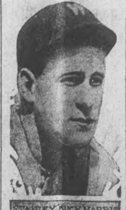
Stanley ("Bucky") Harris is the youngest manager in either of the two major baseball leagues, but he is one of the biggest figures in American sports today as the manager of the Washington Club in the American League.