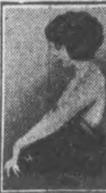
Edna Wallace Hopper

For many years I have sought and consulted some of the world's greatest experts on hair. They all agree that hair health comes from a clean and healthy scalp. Combat the hardened oil and dandruff which stiffen the hair roots. Tone and stimulate the scalp. Then hair thrives just as flowers thrive in a well-kept garden.