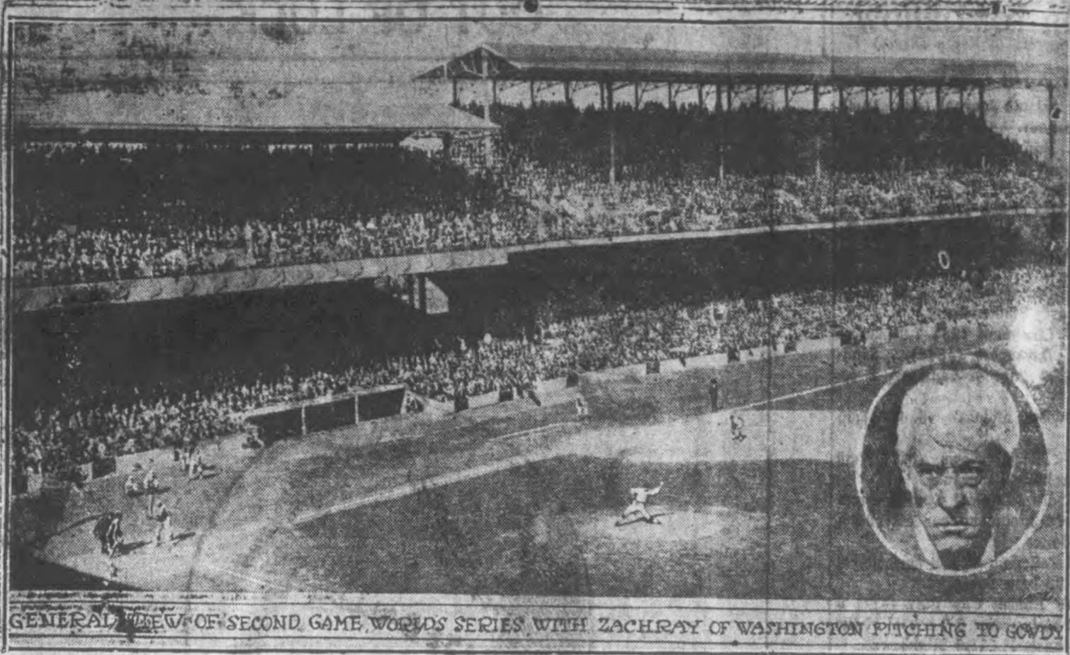
GENERAL VIEW OF SECOND GAME, WORLD'S SERIES, WITH ZACHRAY OF WASHINGTON PITCHING TO GOWDY