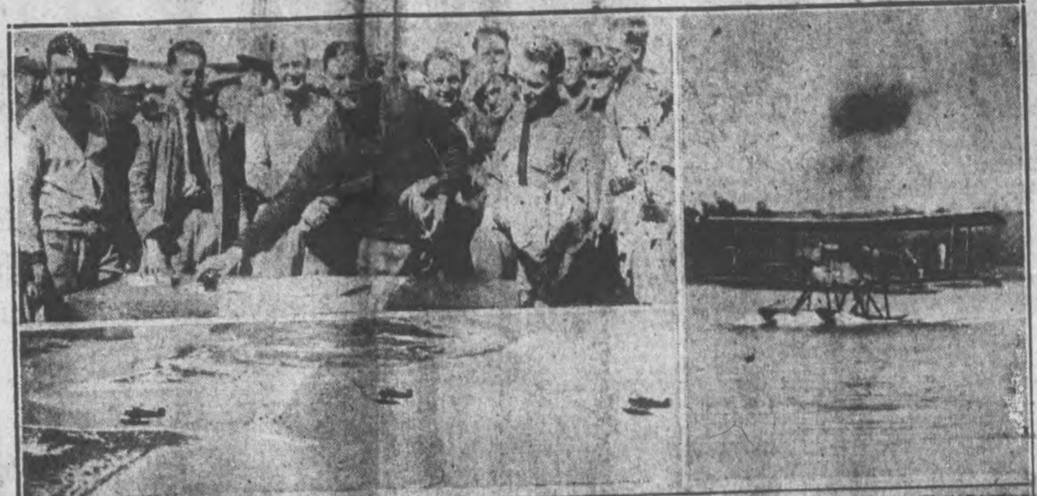
(Above) LIEUT. SMITH SIGNS LOG. (Below) WORLD FLYERS APPROACH BOSTON. (Right) LT. SMITH'S FLAG AT BOSTON

A group of pictures taken when the American world encircling aviators reached Boston is shown. The planes in squadron formation are led by Lieutenant Lowell Smith, with Lieutenant Leigh Wade and Lieutenant Eric Nelson following them. Lieutenant Wade rejoined the party at Boston, N. S. The camera caught Lieutenant Smith's plane just as it touched the water in Boston Bay. A few minutes later the fliers signed the log to mark their first official stop on United States soil. Lieutenant Smith has grasped the pen, while to his right are Wade and Nelson.