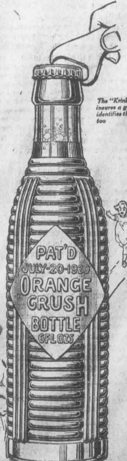
The "Krinkly Bottle" insures a good drink—identifies the genuine, too.