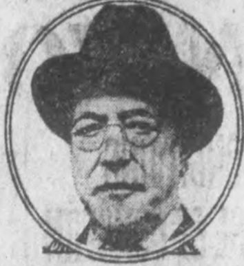
Above: CANON CHASE & MYRON T. HERRICK Below: EUGENE CRIQUI & SAMUEL GOMPERS.