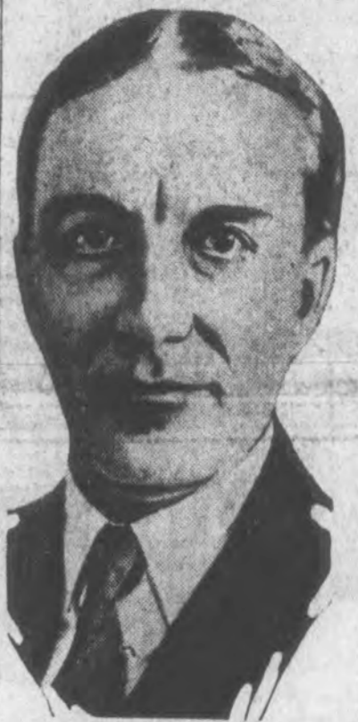
OWEN D. YOUNG

An American citizen will wield more power in Germany than William Hohenzollern ever did if the Allies appoint Owen D. Young as representative of all the Powers to handle the German reparations under the Dawes-Young plan. This photograph of Mr. Young was made during the London conference.