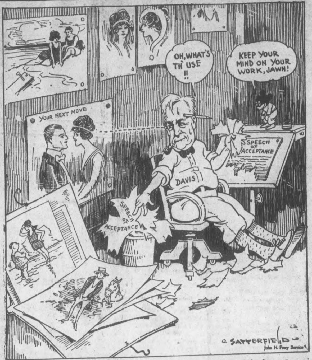
"John W. Davis, Democratic Presidential Nominee, is preparing his speech of acceptance in the studio of the Charles Dana Gibson summer home in Maine." News Item