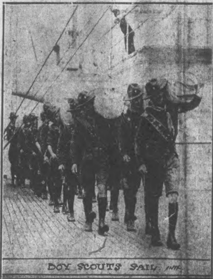
Fifty-two Boy Scouts from all over the United States, selected for their super-excellence, are shown boarding the liner Leviathan in New York, from which they sailed to the International Boy Scout Jamboree in Copenhagen. They will tour the Continent and go to London.