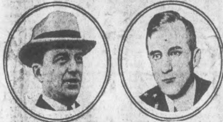
ABOVE: FRED T. DUBOIS & EAMONN DE VALERA. BELOW: OWEN D. YOUNG & SMEDLEY D. BUTLER.

Owen D. Young, of New York, will be the "Reparations Agent" of the Reparations Commission and arbiter of all disputes between the Allies and Germany. It is said he will wield more power than any other man in the world. The Irish Free State has decided to release Eamon de Valera, who has been interned since last August. Former U. S. Senator Fred T. Du Bois, of Idaho, has been appointed U. S. member of the International Joint Boundary Commission, controlling the American-Canadian frontier. Brigadier-General Smedley D. Butler will retire, at the expiration of his year's leave of absence, from command of the Philadelphia police force and fire department and return to the U. S. Marine Corps.