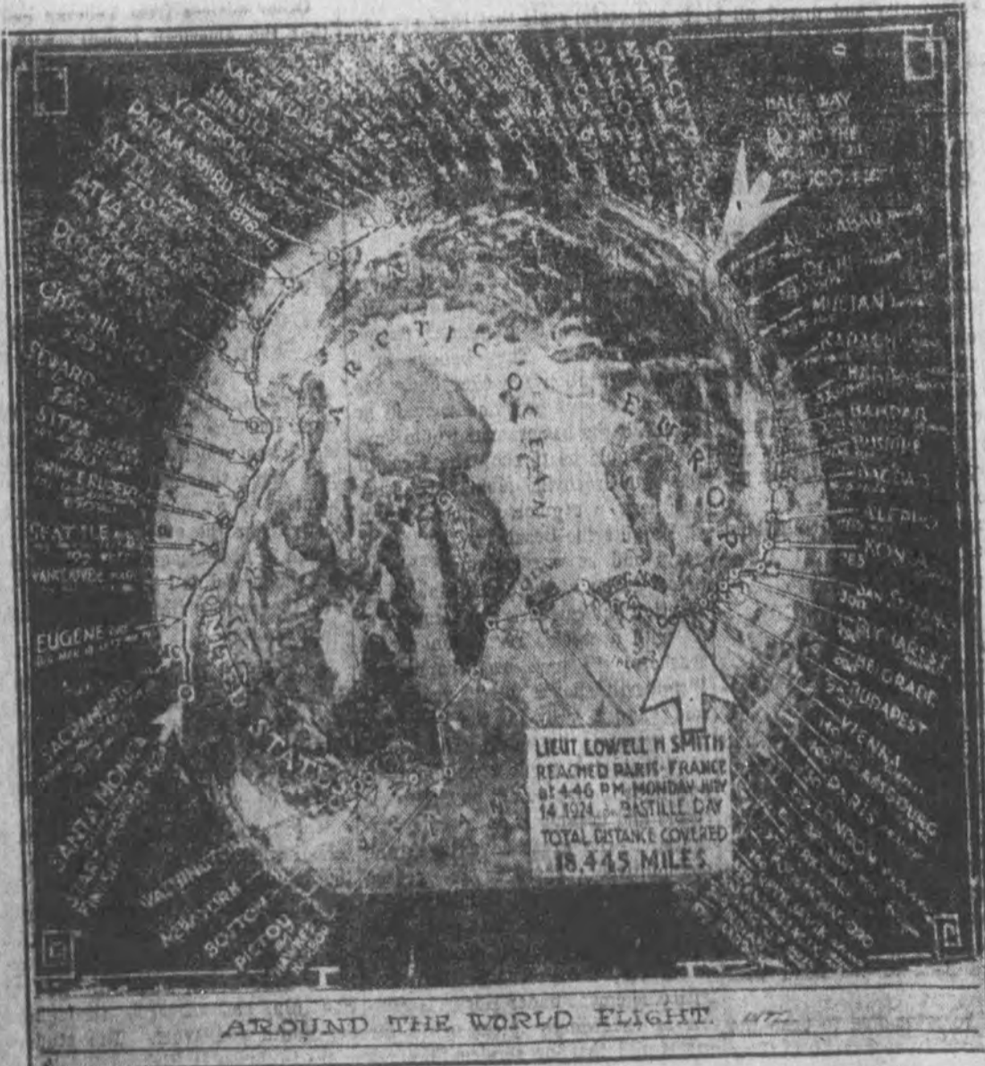
American army fliers who left Santa Monica, Cal., on March 17, are now preparing to hop off from Brough, near Hull, Eng., for the Orkney Islands for their flight across the Atlantic to Iceland, Greenland, and finally the main land of America in the first around-the-world flight. This map shows each "hop" of the intrepid fliers, together with the distance flown. The longest single flight was from Attu Island to Paramastury Island, in the Pacific, 578 miles.