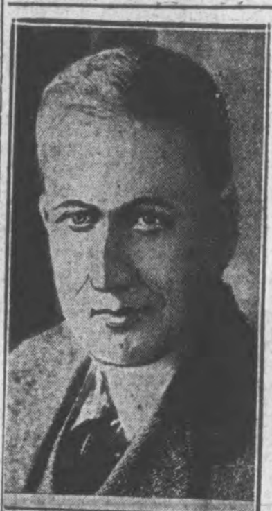
Senator O.K. Wheeler.

Washington, July 19.—Senator Wheeler, of Montana, who won national distinction by his conduct of the Senate Dugherty investigation, today accepted the vice-presidential nomination of the La Follette Independent ticket and immediately began his campaign with a broadside against the political affiliations of Calvin Coolidge and John W. Davis the Republican and Democratic nominees.