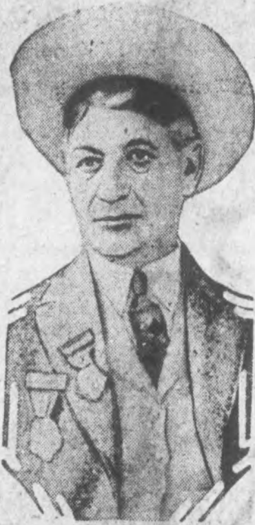
CYCLONE BILL LYONS.

State Senator William ("Cyclone Bill") Lyons, of Colorado, a staunch McAdoo boomer, was a prominent and picturesque figure at the Democratic National Convention in New York City.