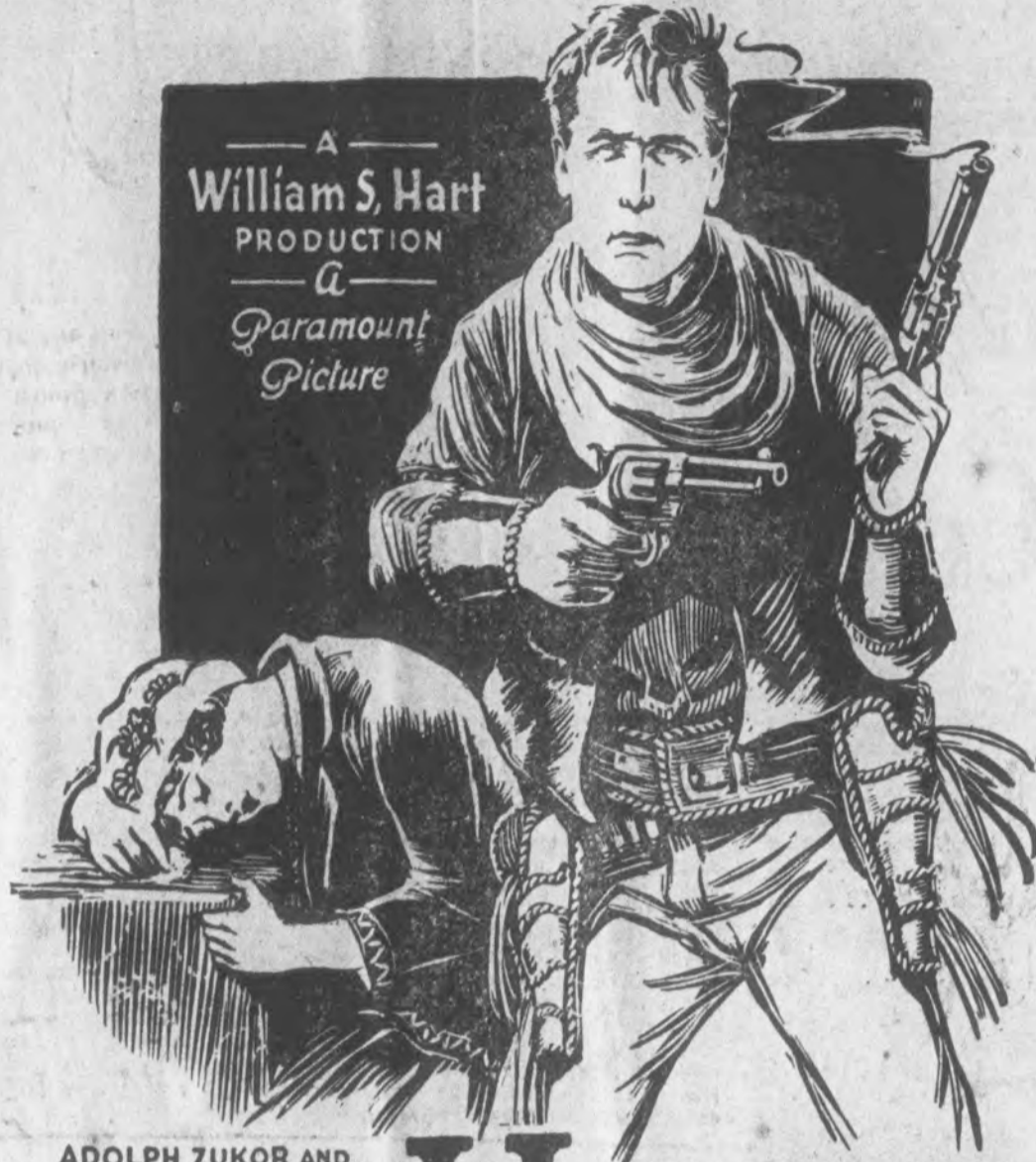
ADOLPH ZUKOR AND JESSE LLASKY PRESENT

with nothing blazare in their ensemble, Norma's gowns are ideally suited to her personality. Norma seldom wears jewelry. She abhors tinselly effects, embroidery and the other gee-gaws which appeal to some very young girls and "girls" who because of the inroads of time are not so sure of their charms. For day-time wear Norma prefers very heavy crepes, charmine and alone velvet. She uses very little trimming, but when she does she shows a preference for sable and other expensive furs. However, Miss Talmadge is very particular as to the cut and lines of her gowns and will spend hours in seeing that they are draped perfectly. For evening Norma likes chiffons, chiffon velvet and very thin sheer lace dresses. Low shoes with strappings high on the ankle and medium heels for both day and evening wear appeal most to her. For sports she nearly always wears white with jade jewelry.