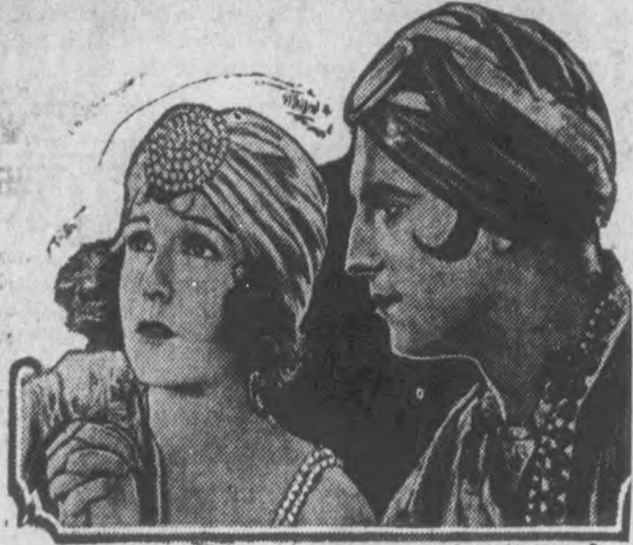
Norma Talmadge and Joseph Schildkraut in "The Song of Love"

What do the stars wear off the screen? One hears much and sees enough photographs of the clothes they wear in pictures, but most of the "stills" showing the stars "at ease" look as if some department store had taken its latest Montmartre fashions to Hollywood and asked the stars to pose in them for one afternoon only. However, the clothes worn by such stars as Norma Talmadge, Mary Pickford, Constance Talmadge, Gloria Swanson and Pola Negri are distinguished more for their simplicity than their eccentricity. As the first of a series of interviews with the stars on their "off screen" clothes, Clara West, Norma Talmadge's costumer, was visited. According to Miss West, who designs both Norma's photoplay and home costumes, Norma prefers the utmost simplicity in her clothing. All of Norma's day and evening gowns are of the most elegant materials, but of the simplest possible design. Quiet in tone and cut, and