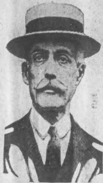
ANDREW W. MELLON