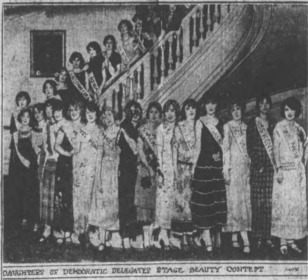
DAUGHTERS OF DEMOCRATIC DELEGATES STAGE BEAUTY CONTEST.