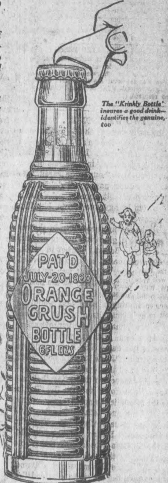
The "Krinkly Bottle" insures a good drink—identifies the genuine, too.

Ward's Crushes are more than merely delicious—they are wholesome and have real food value. Read our formula. Here it is: To the natural fruit oils of oranges, lemons and limes are added citrus fruit juices, carbonated water, fruit acid, U. S. Certified food color and pure cane sugar.