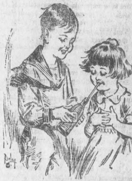
ORANGE CRUSH BOTTLING CO., Phone 180