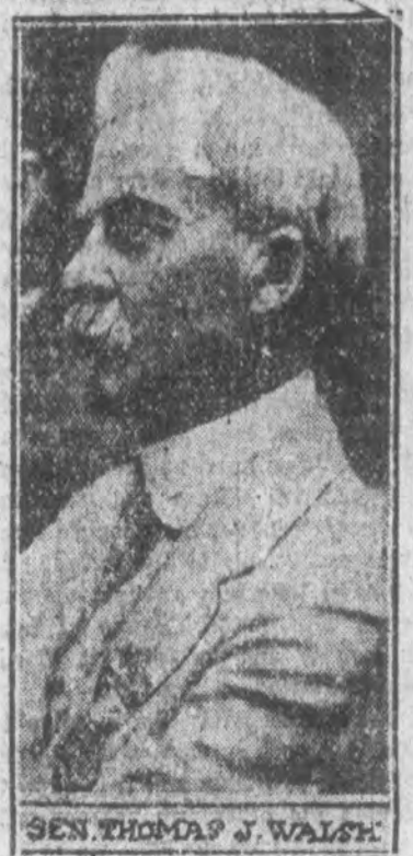
United States Senator Thomas J. Walsh, of Montana, is pictured here as permanent chairman of the Democratic National Convention in New York City.