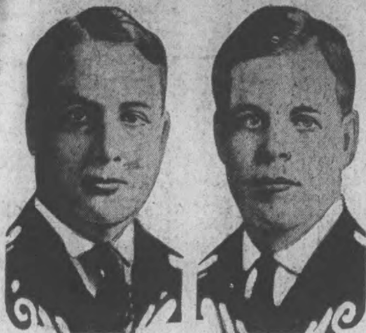
O.P. & M.J. VAN SWERINGEN. 1914.

Without waiting for official confirmation, financial circles have accepted as a fact the report that O. P. and M. J. Van Sweringen, multimillionaire railroad kings, of Cleveland, O., have bought control of the Erie Railroad and will merge it as part of a 10,000-mile railroad system, numbering in it the Nickel Plate, the Chesapeake & Ohio, Pere Marquette, Virginian, and possibly the Pittsburgh and West Virginia.