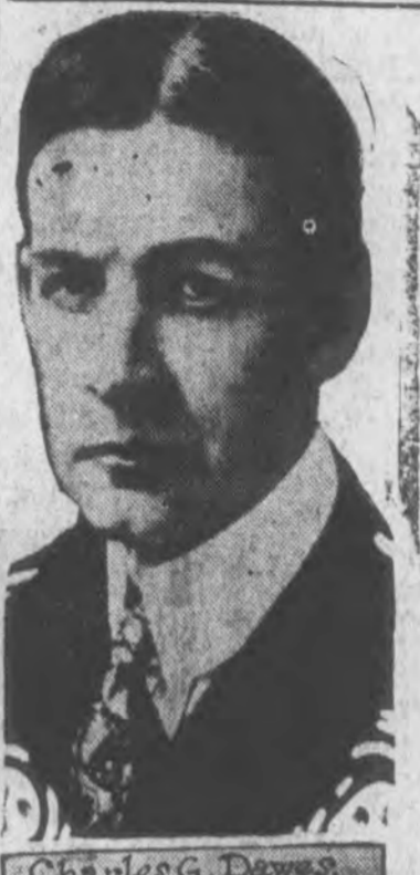
Charles G. Dawes