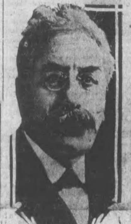
M. MILLERAND, PRES.

Paris, June 10.—President Millerand in a message sent to Parliament today refused to resign his office.