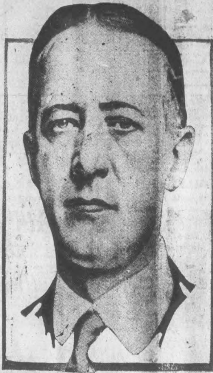
ALFRED E. SMITH

Cheered by the delegates and alternates to the Democratic State Convention in Albany, N. Y., Governor Alfred E. Smith threw his hat into the ring for the Democratic nomination for the Presidency.