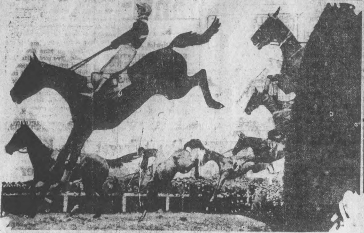
GRAND NATIONAL STEEPLECHASE.