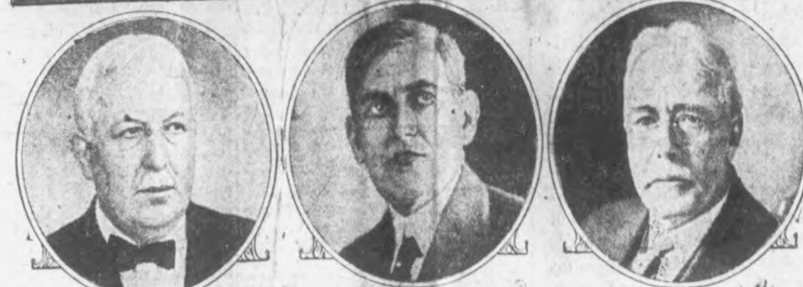
Thomas Taggart, Democratic leader of Indiana, declared in New York that U. S. Senator Samuel L. Ralston, former Governor of Indiana, was certain to be nominated and elected as the Democratic candidate for the Presidency.