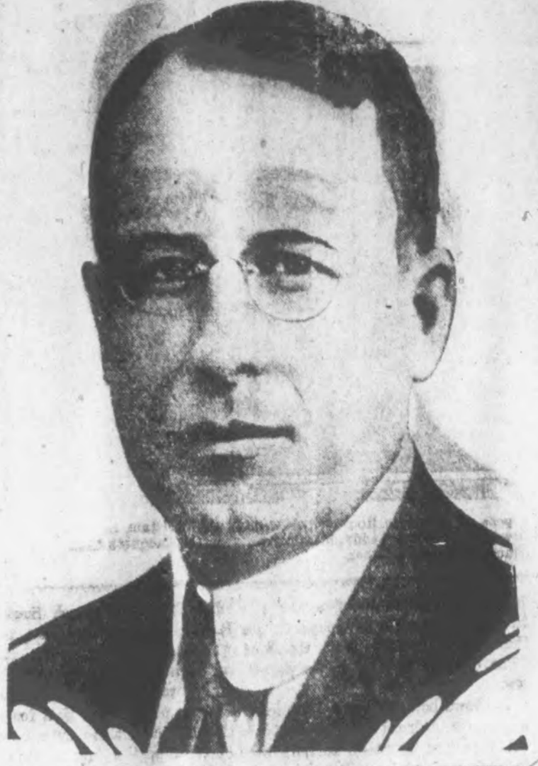
Former Governor James M. Cox, of Dayton, O., has announced that he is again a candidate for the Democratic nomination for the Presidency in 1924. He was nominated in 1920 and defeated by President Harding.

Morning service at 11 a. m. Junior Endeavor, 3 p. m. Intermediate Endeavor 5:30 p. m. Senior Endeavor, 6:30 p. m. Evening service 7:30 p. m. Everybody welcome.