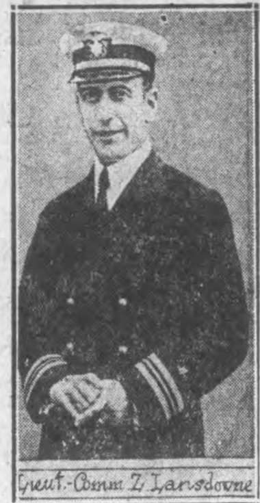
Lieutenant-Commander Zachary Lansdowne, U. S. N., who was official observer for the Navy on the flight to America and back of the British dirigible R-34, will command the American dirigible Shenandoah on her flight to the North Pole this summer.

Lansdowne to Command Shenandoah to Pole.