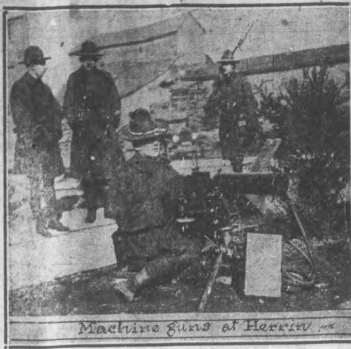
Machine gunners of the Illinois National Guard are shown training their guns on the streets of Herrin, now in the grip of a fight between "wets" and "drys," in which the Ku Klux Klan has been involved. The troops were rushed there to prevent a recurrence of the bloody massacre during the mine war a year ago.