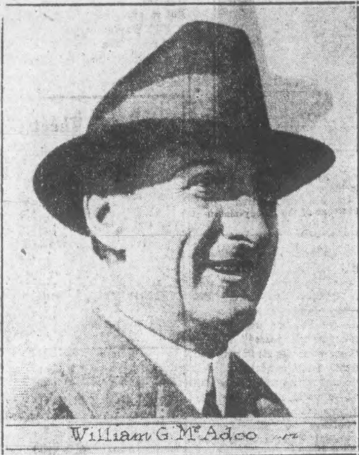
William G. McAdoo

William G. McAdoo is pictured as he left the U. S. Senate Office Building in Washington, where he appeared before a Senate investigating committee to defend his acceptance of an annual retainer from E. L. Doheny, oil magnate.