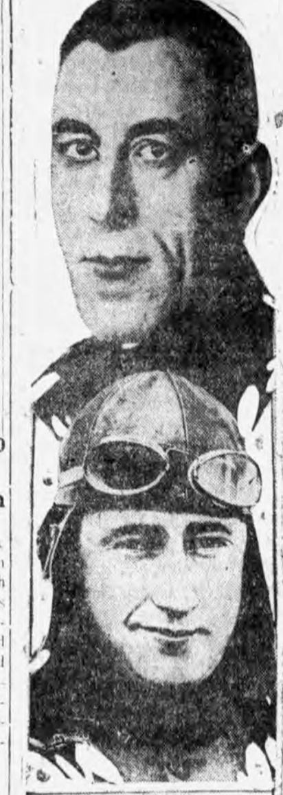
Major Frederick L. Martin, noted war flyer, has been chosen by Major-General Mason Patrick, chief of the U. S. Army Air Service, to command the officers who will participate in the army's around-the-world flight next Spring. Major Martin, a native of Indiana, was born in 1882. One of his pilots will be Lieutenant Lowell H. Smith, a native of Santa Barbara, Cal., 30 years old. He was a captain in the flying forces overseas in the World War.