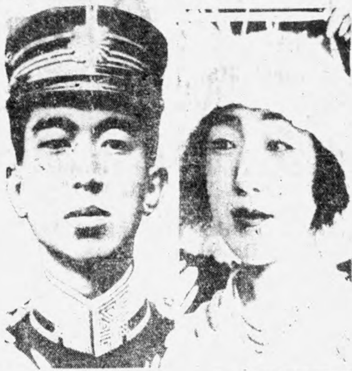
Prince Hirohito and Princess Nagako Kuni.

The date of the wedding of Prince Regent Hirohito of Japan, who has been the ruler of Japan since the Mikado's mind gave way, to Princess Nagako Kuni has been definitely set for January 27. The wedding was to have occurred in December, but was postponed because of the earthquake disaster.