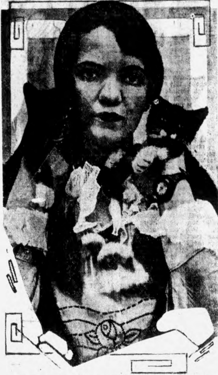
Nina Wilcox Putnam