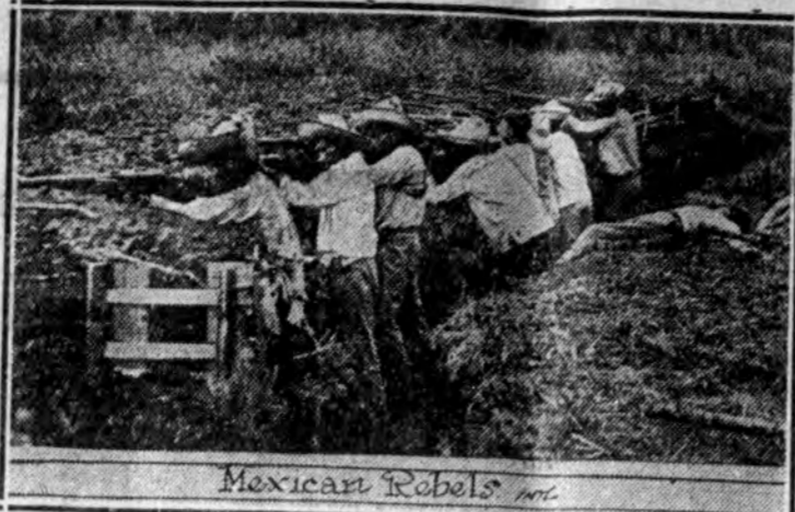
This picture, taken under fire, shows the de la Huerta rebel troops in action in the Vera Cruz district, under bombardment and rifle fire from the loyal Oregon attackers. One man is shown dead on the back of his shallow trench.