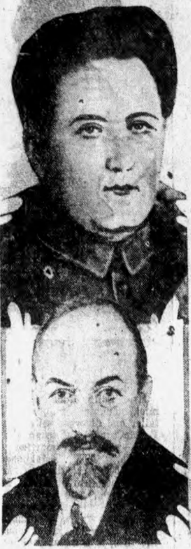
President Lenin and Georges Tchitcherin

Violent war has broken out in the United States Senate over the blunt vote of Secretary of State Hughes to Georges Tchitcherin, Soviet Foreign Minister, declining to enter into any negotiations for recognition of Russia. Following his note Mr. Hughes made public a document from President Zinoviev directing members of the Workers' Party of America to organize "fighting units" and drill them in "fire-arms and trench digging, with a view to flying the red flag of Communism over the White House.