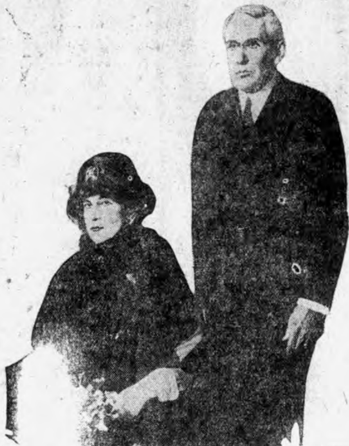
Mrs. Frank B. Kellogg, wife.

Hon. and Mrs. Frank B. Kellogg were photographed as they sailed from New York to London, where Mr. Kellogg will take up his duties as Ambassador Extraordinary and Minister Plenipotentiary to the Court of St. James, succeeding Colonel George Harvey.