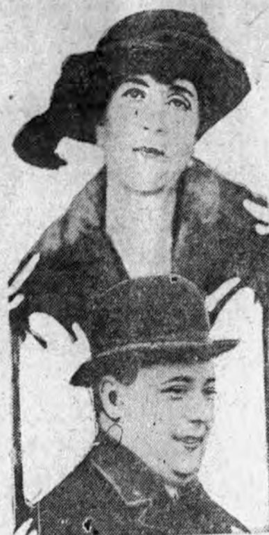
Mrs. Edith McCormick