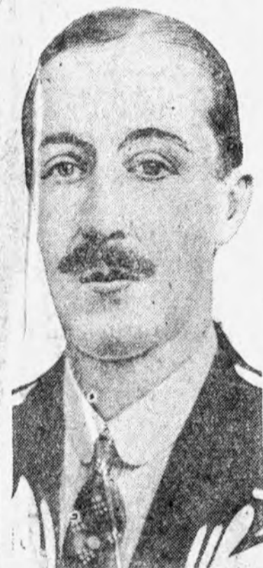
Duke of Alba