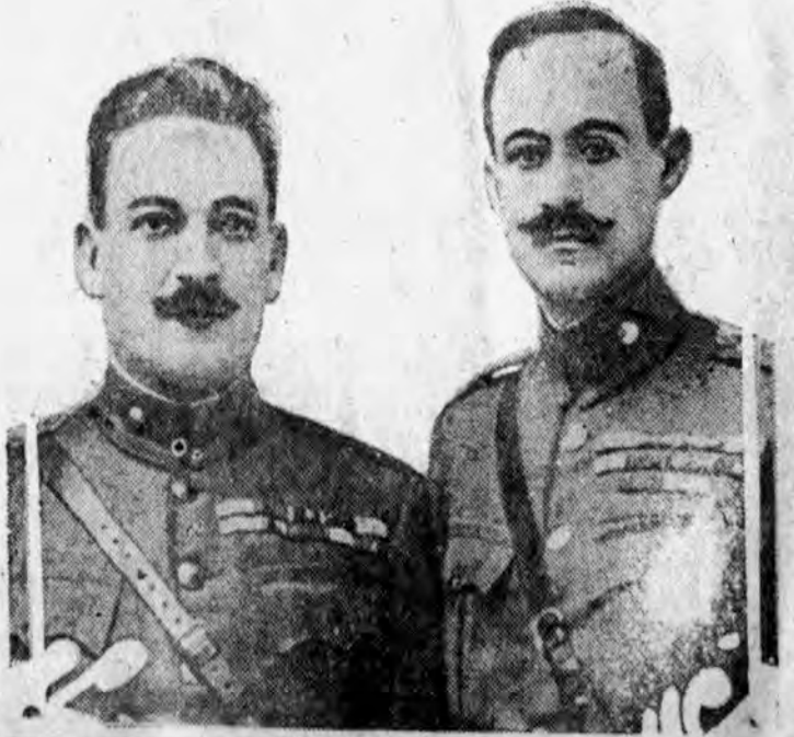
Premier Stephanos Gonatas and Gen. Plastiras.

Premier Stephanos Gonatas and General Plastiras, the two men who, upon demand of the last Greek revolt, gave King George and Queen Olga "leave of absence" to quit Greece pending a determination of the future form of government. It is not believed they will be permitted to return.