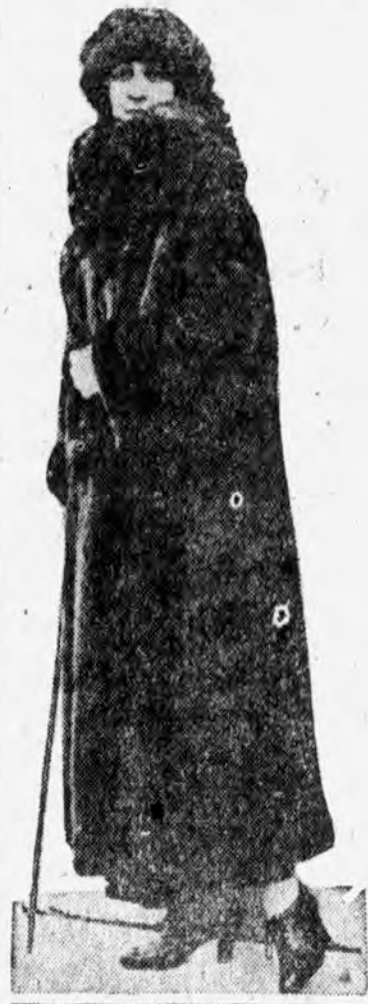
Miss Doris Keane.