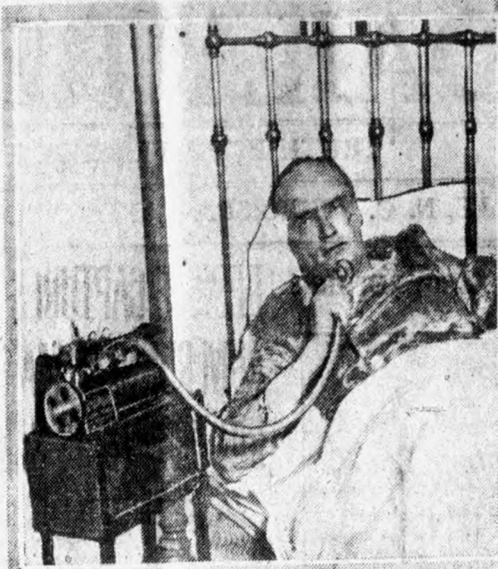
When Louis Joseph Vance, famous novelist, author of the Lone Wolf and other stories, was forced by an infected arm to suspend work on his new novel, the Waldorf-Astoria, his New York home, installed a dictaphone so that he could carry on as usual.