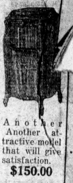
Another attractive model that will give satisfaction. $150.00

You could not present the family with a gift that would be appreciated more than a VICTROLA from one of the many models we have in stock. If we haven't the style you wish, by placing your order now, we can have it here for delivery before Xmas. Let this be a season when every member of the home will be made glad.