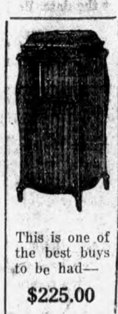
This is one of the best buys to be had— $225.00

You could not present the family with a gift that would be appreciated more than a VICTROLA from one of the many models we have in stock. If we haven't the style you wish, by placing your order now, we can have it here for delivery before Xmas. Let this be a season when every member of the home will be made glad.