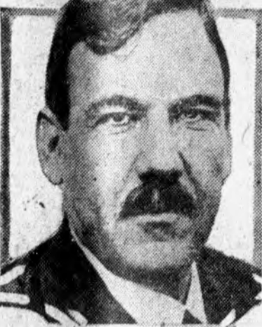
Above: Alvaro Obregon Below: Adolfo de la Huerta.

A large part of the Mexican army in many Mexican states has revolted against the rule of President Alvaro Obregon, the one armed military hero, and has declared for the candidacy of Adolfo de la Huerta, ex-Minister of Finance, asserting Obregon's tactics made a fair election impossible for De la Huerta.