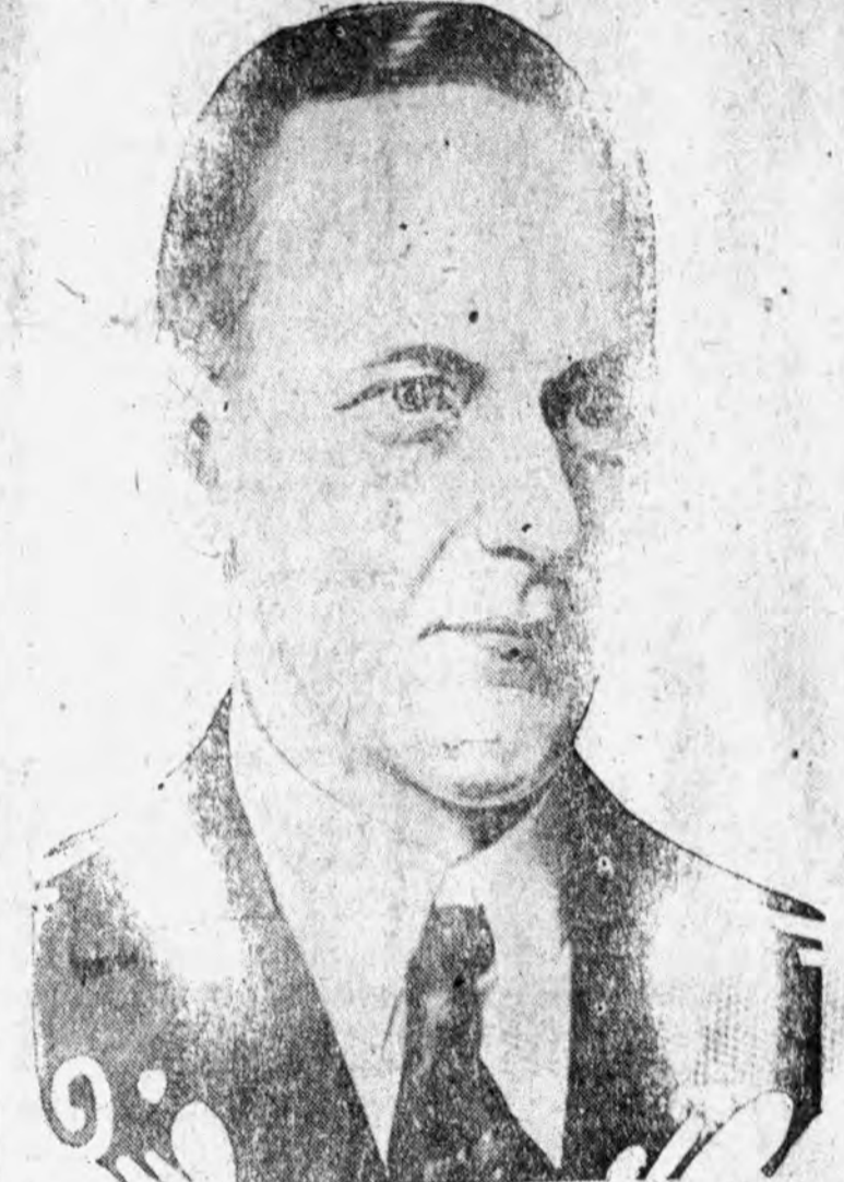
President Calvin Coolidge