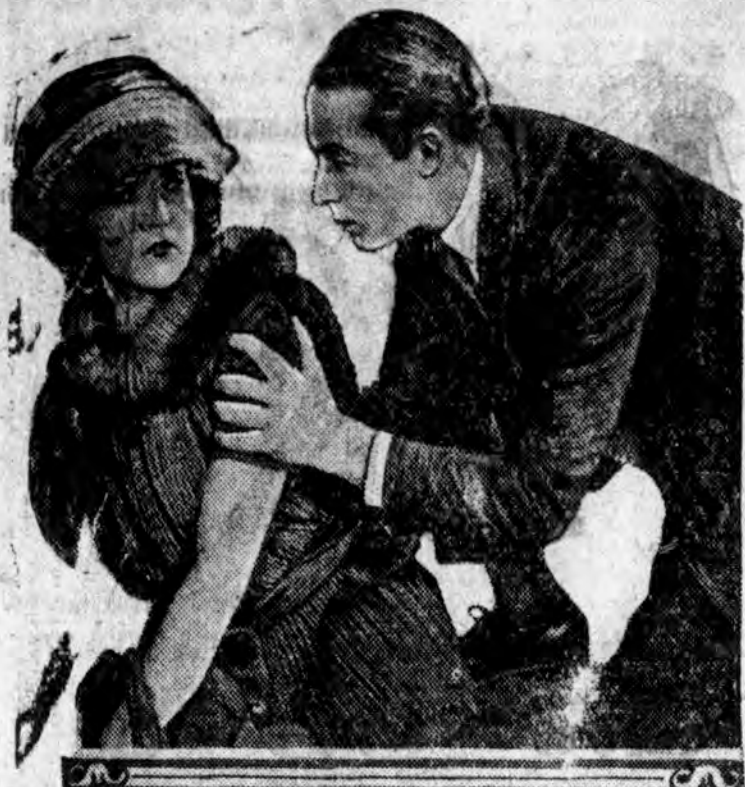
Scene from "BRASS" A Warner Bros. Production

Marie Prevost in BRASS—Strand Monday and Tues.