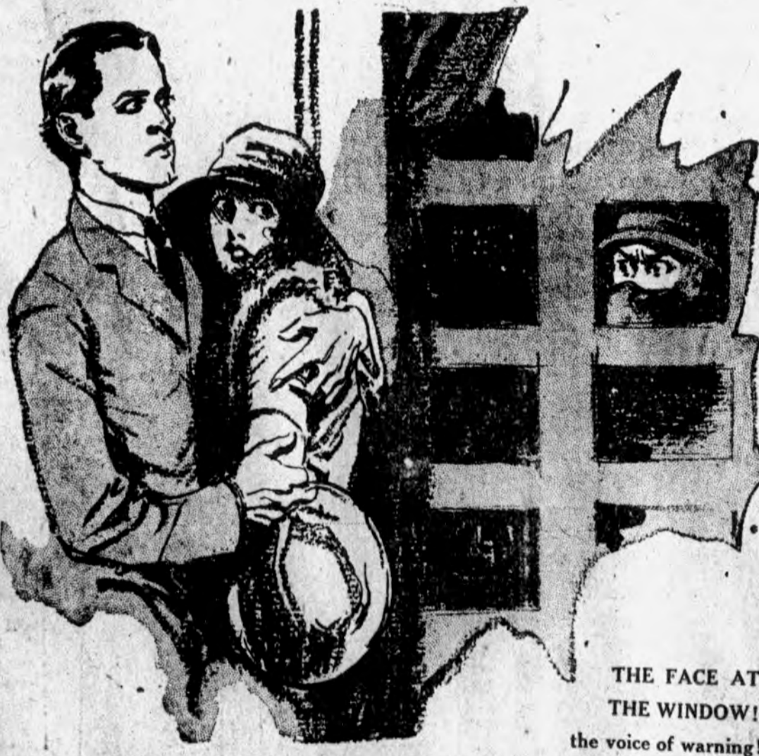
THE FACE AT THE WINDOW! the voice of warning!

Here is a mystery play that will keep you guessing and gasping to the end! What did they mean in the love affairs of beautiful Ruth Carson? What strange power sent the Pullman Special crashing to almost certain disaster in the valley?