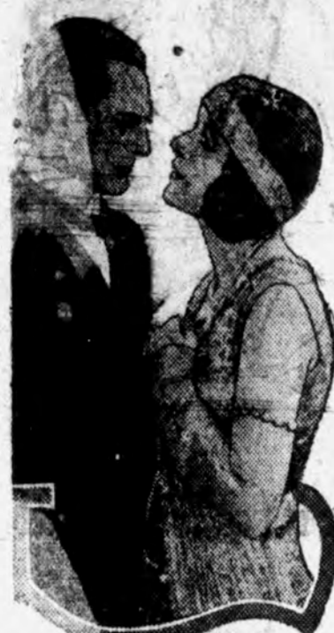
Lionel Barrymore and Alma Rubens in a Cosmopolitan Production "ENEMIES OF WOMEN" Distributed by Goldwyn-Cosmopolitan