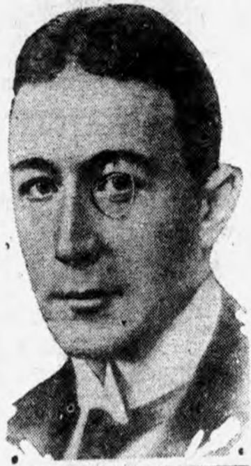
Dr. Hans A. Dorten is head of the government of the Rhineland to separate itself from Germany.