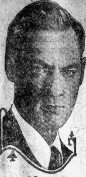
Lionel Barrymore in a Cosmopolitan Production ENEMIES OF WOMEN Distributed by Goldwyn-Cosmopolitan