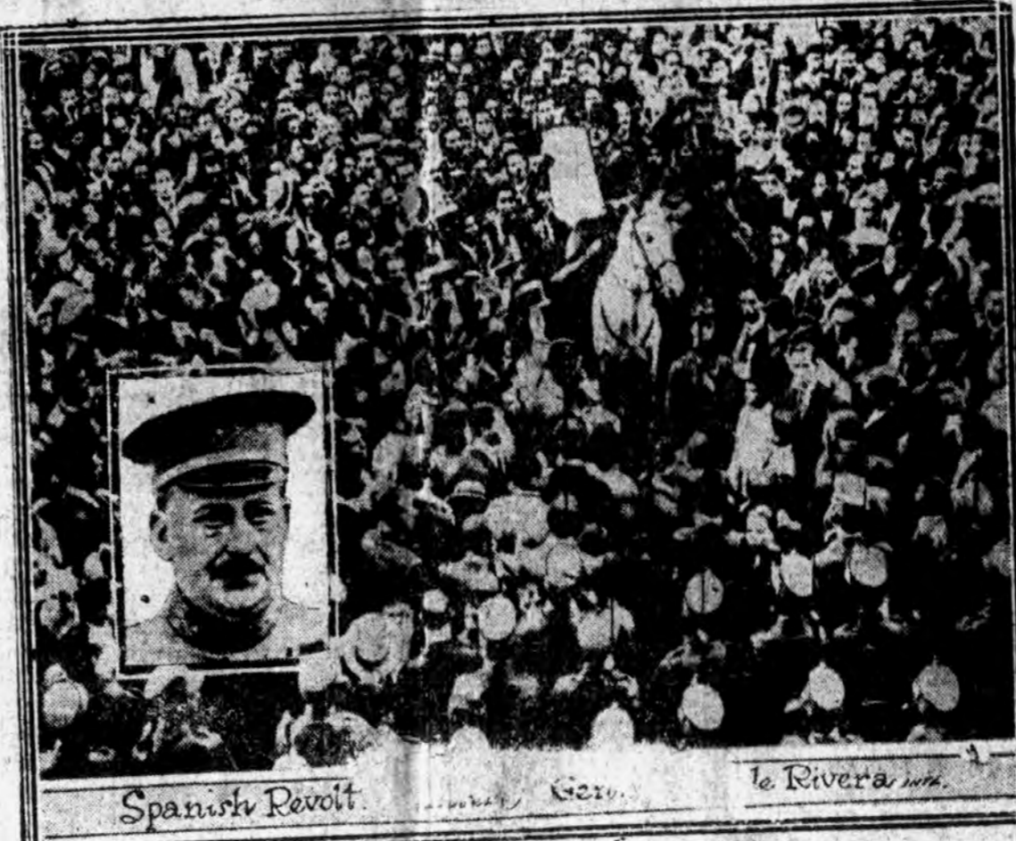
These photographs, the first to reach America, show the revolt of the Spanish army, which resulted in the overthrow of the Alba Ministry and the appointment of a military and naval admiral in control of the nation. A military marshal is shown reading the proclamation of martial law to the mobs in Madrid, while the insert shows General Rifo Rivera, the new head of the Spanish government.