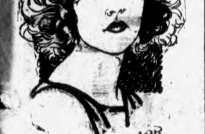
Betty Compson in the Paramount Picture "The Woman With Four Faces" A Herbert Brenon Production

Betty Compson and Richard Dix featured in "The Woman With Four Faces."