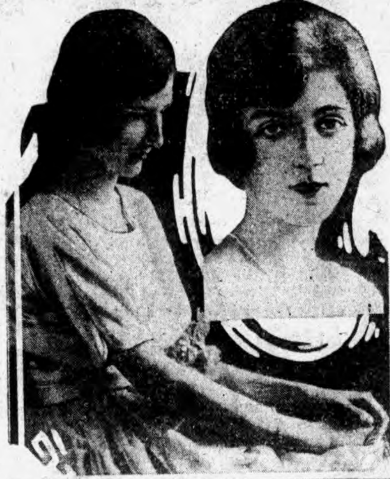
Princess Giovanna (left) & Princess Mafalda.

Princess Mafalda, second daughter of King Victor Emmanuel and Queen Elena of Italy, is dangerously ill at the royal villa, at Racconigi, near Rome, suffering from fever and intestinal trouble. Her younger sister, Princess Giovanna, who was also ill, is recovering. Seven doctors are in attendance on Princess Mafalda, and it is feared she will collapse from insomnia.