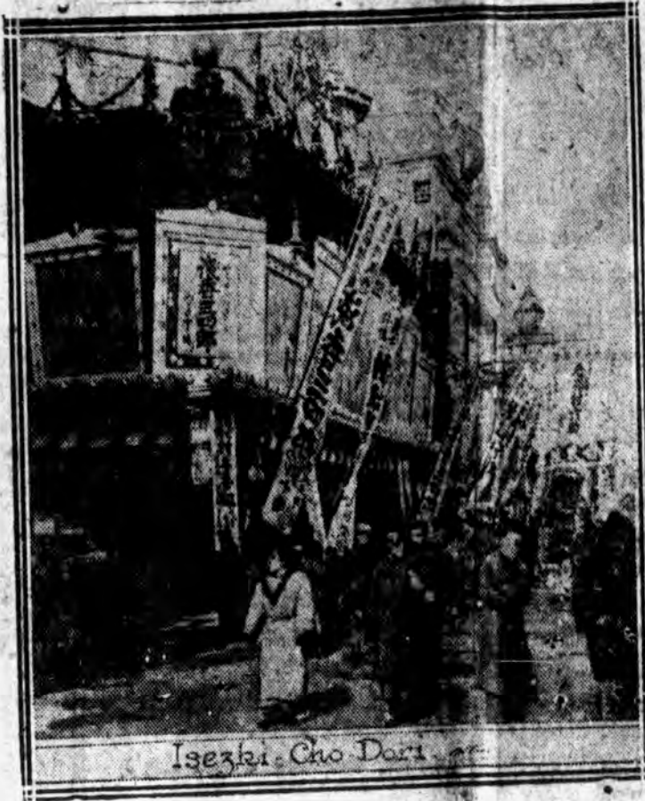
Here is the Isezki-Cho-Dori (A museum Street), in Tokio, totally destroyed by earthquake and flames. This street boasted more electric lights than New York's vaunted Gay White Way.