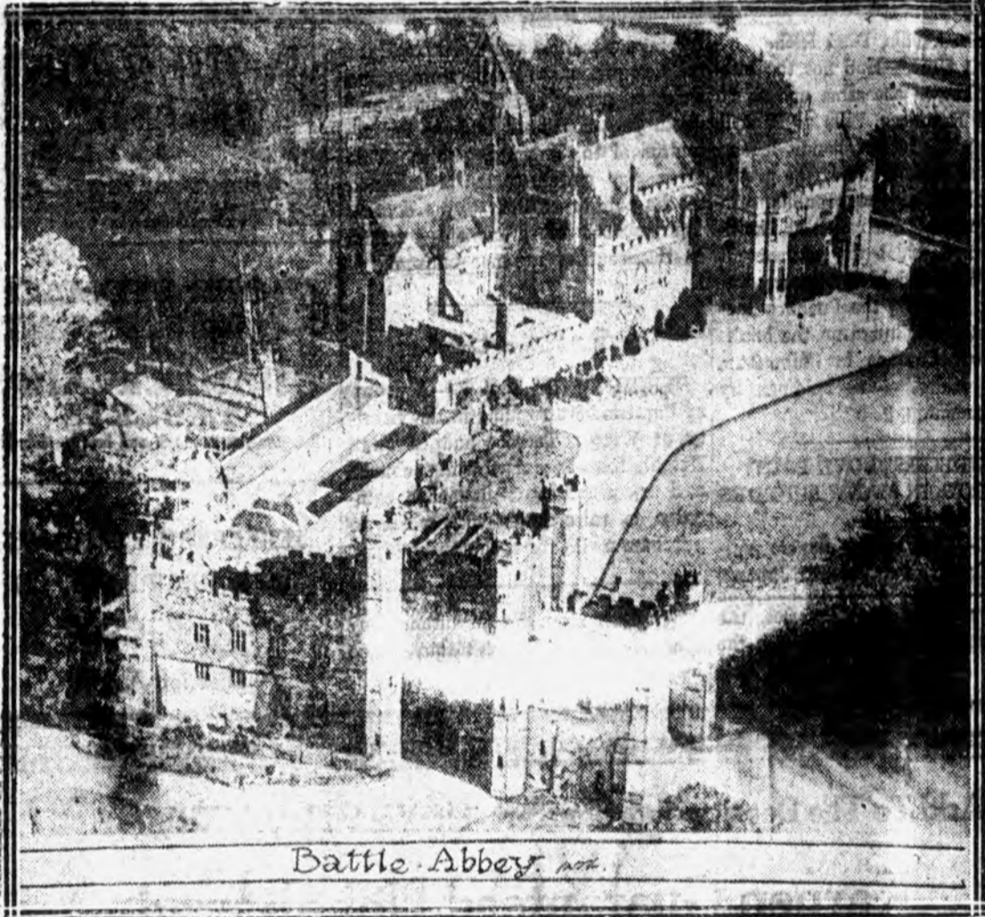
Battle Abbey, N.C.