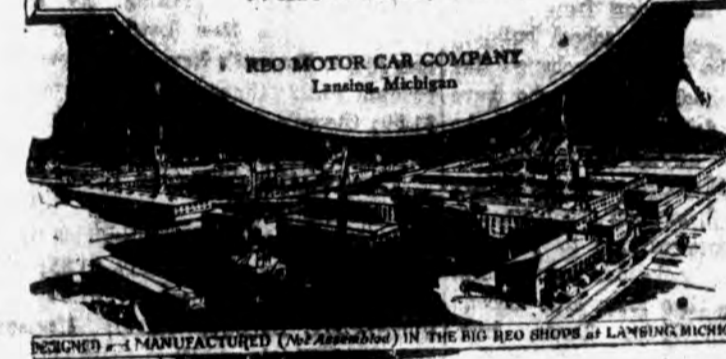
REO MANUFACTURED IN THE REO GROUP AT LANSING, MICHIGAN