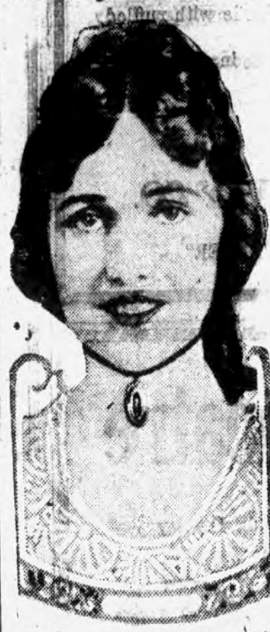
AGNES AYRES IN "HELD BY THE ENEMY" A PARAMOUNT PICTURE

Picturization of Wm. Gillette's Celebrated Play Notable Screen Achievement.