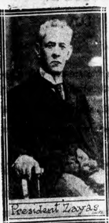
President Alfredo Zayas, of Cuba, is facing a serious crisis, both inside his island and in his relations with the United States Government, which he admitted to be strained.

will be present on this occasion in order to meet and assist in welcoming the people who come.