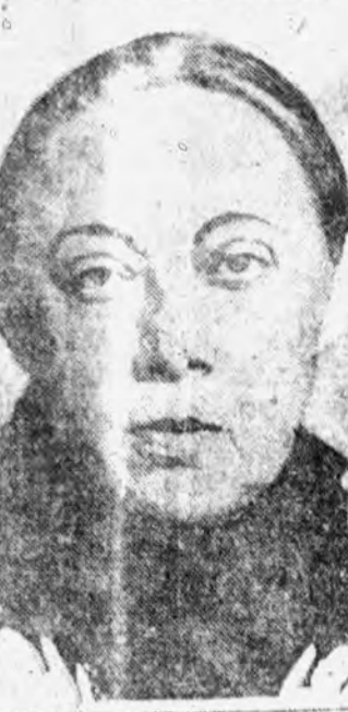
Mrs. Nikolai Lenin, wife of Nikolai Lenin, former of Soviet Russia, is a noted educator.