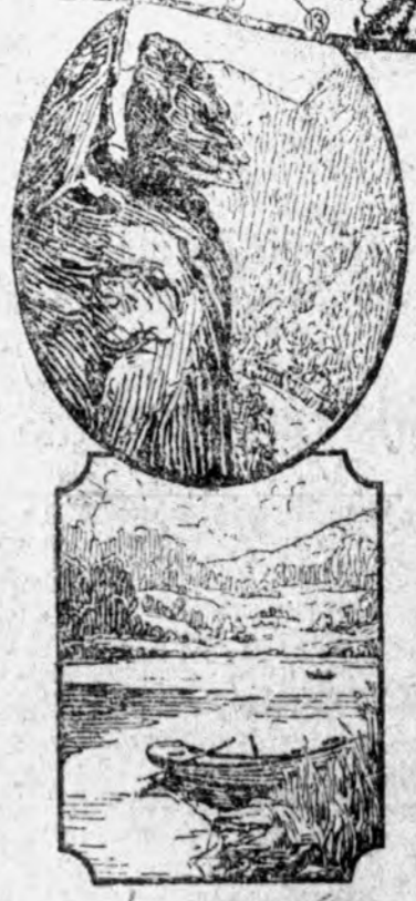
Lake Junaluska, near Waverly, 26 miles from Asheville. A charming spot where there is plenty of canoeing, bathing and boating.

Devil's Head, one of the many curious rock formations in the vicinity of Chimney Rock. Looks as though it might topple over any minute.