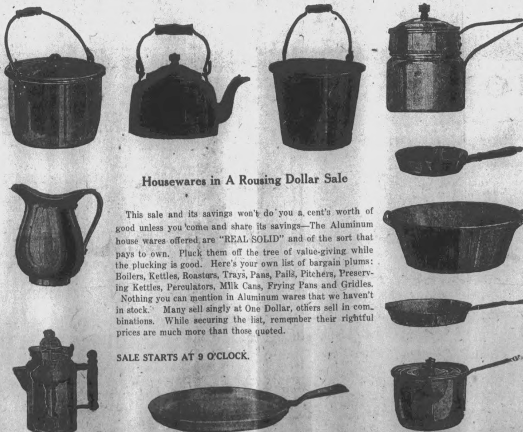
Housewares in A Rousing Dollar Sale

ALL ITEMS AFFECTED IN DOLLAR DAYS ABSOLUTELY CASH