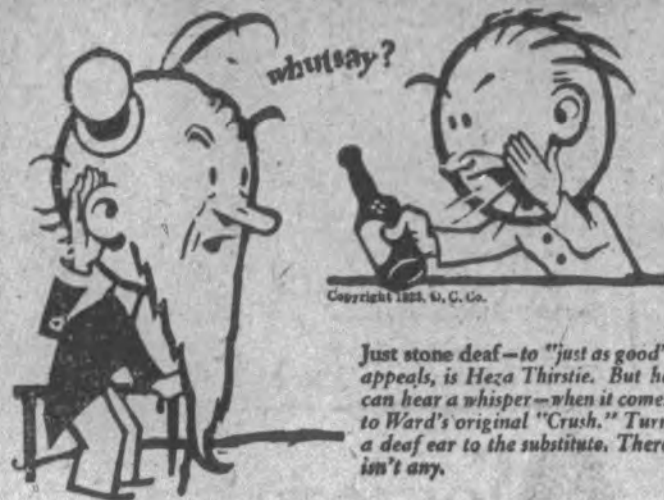
Just stone deaf—to "just as good" appeals, is Heza Thirstie. But he can hear a whisper—when it comes to Ward's original "Crush." Turn a deaf ear to the substitute. There isn't any.