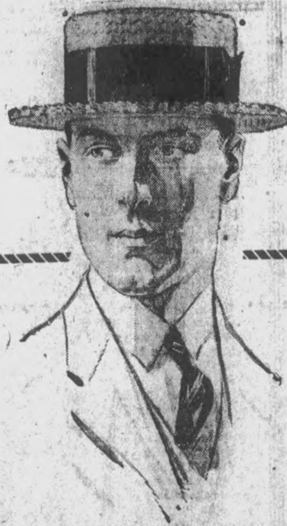
STRAW AND PANAMA