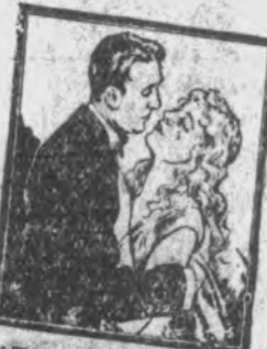
IN THE BONDS OF LOVE