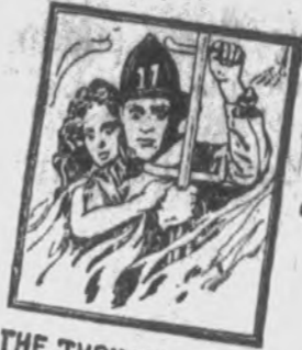
THE THRILLING RESCUE