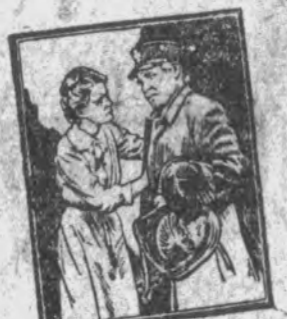
BREAKING THE SAD NEWS