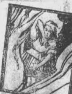
IN THE CLUTCHES OF THE FLAMES

Bestrides the Show World like a Colossus—The most stupendous exhibition of twentieth century realism ever flung upon the screen— A colossal drama of the heart and soul of America that glorifies and immortalizes the firemen of the nation and their loyal wives, sons and daughters! It's very flames will burn an everlasting impress on your soul!