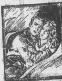
TRAPPED IN THE INFERNO