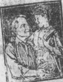
HE LOVED THE LITTLE CRIPPLE